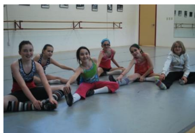
Dancers at the February Workshop at Dance Saskatchewan