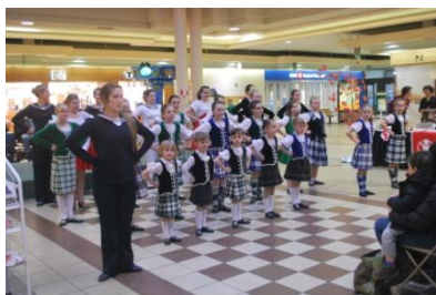
Save the Children Dance Out at Market Mall